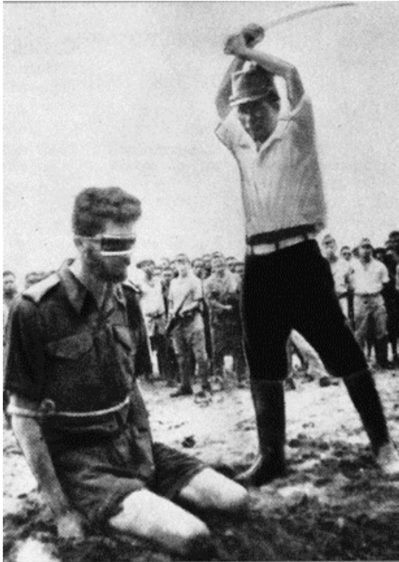
Treatment of POWs by Japanese soldiers