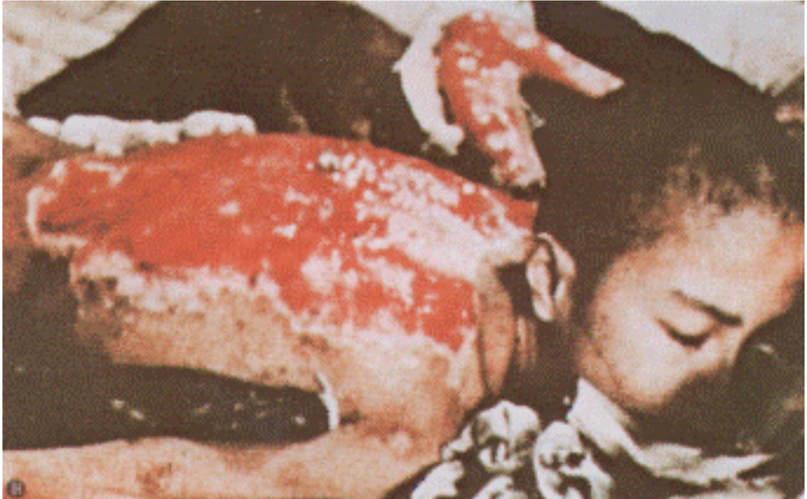
A boy's burned flesh after the atomic bombing of Hiroshima