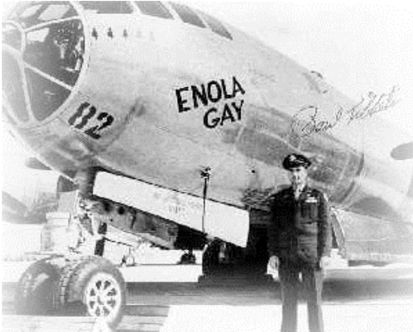
General Paul Tibbets and the Enola Gay