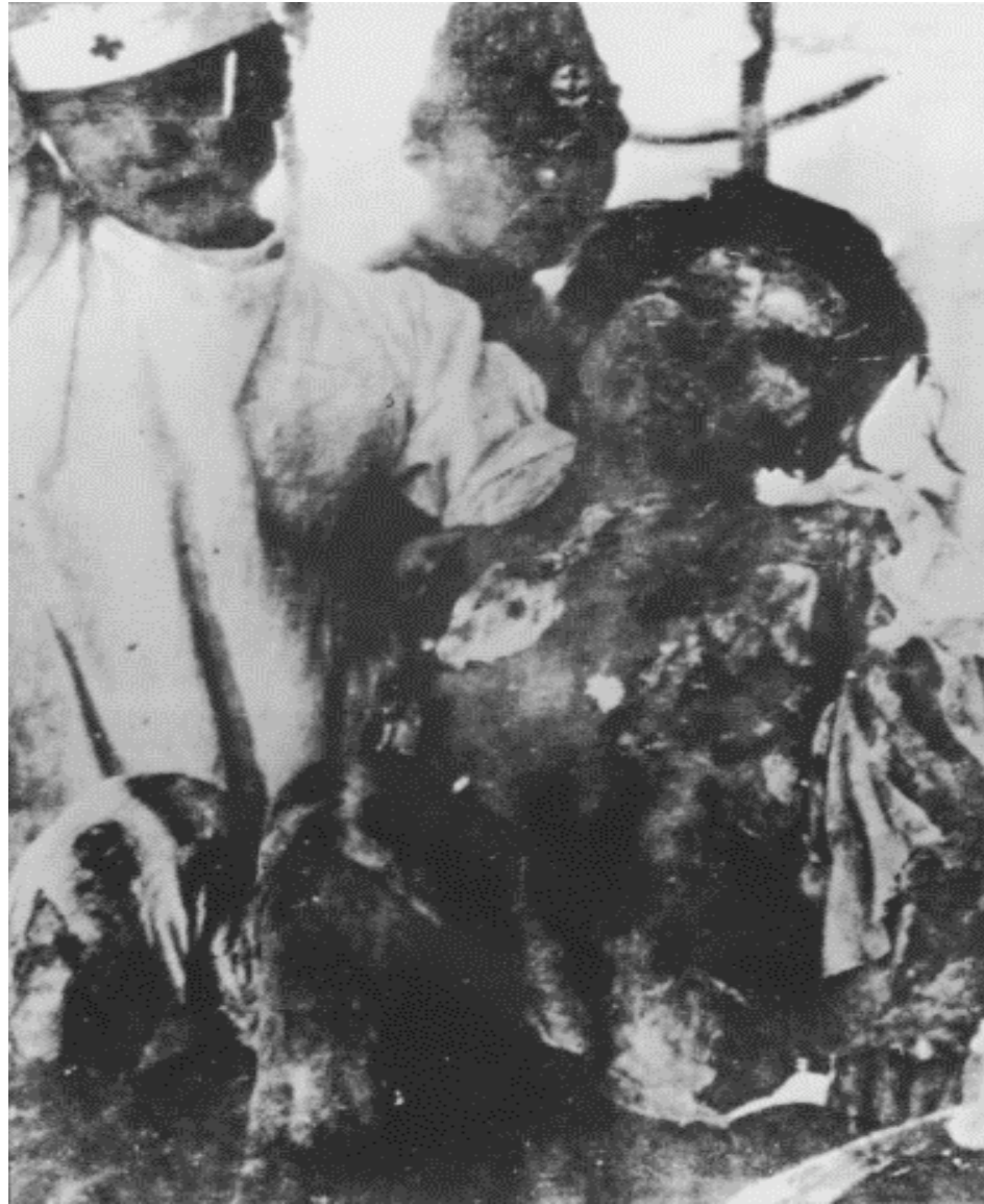
A girl with her skin hanging in strips after the atomic bombing of Hiroshima