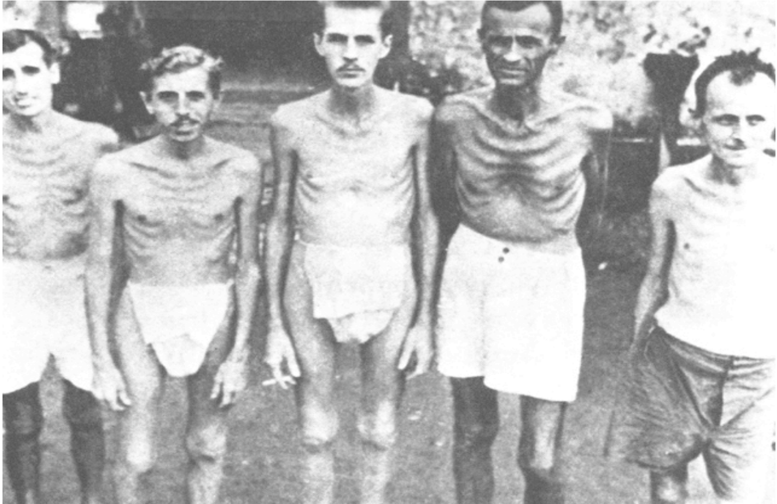
American Survivors of the Bataan Death March