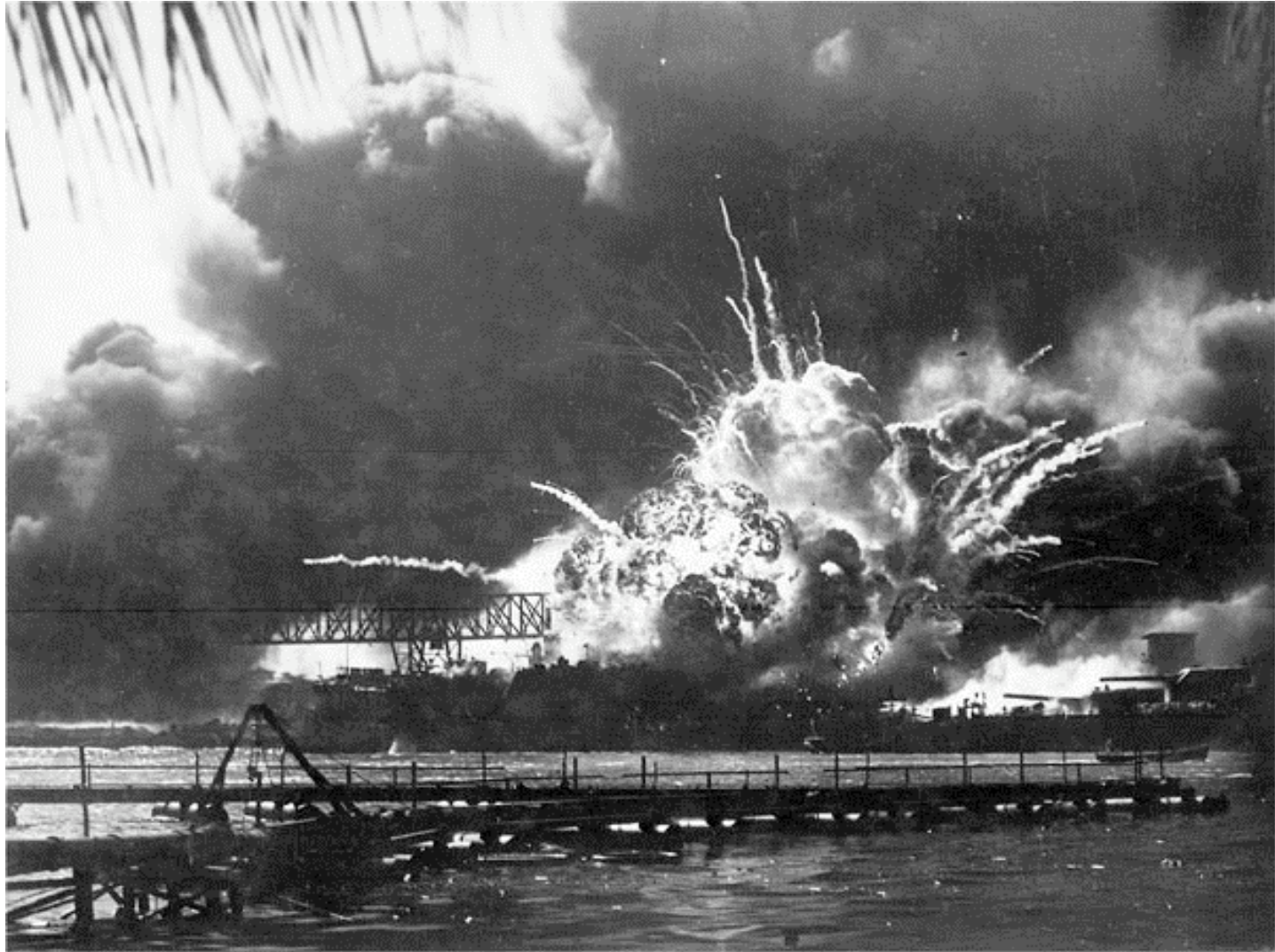
Japanese bombing of Pearl Harbor. December 7, 1941.