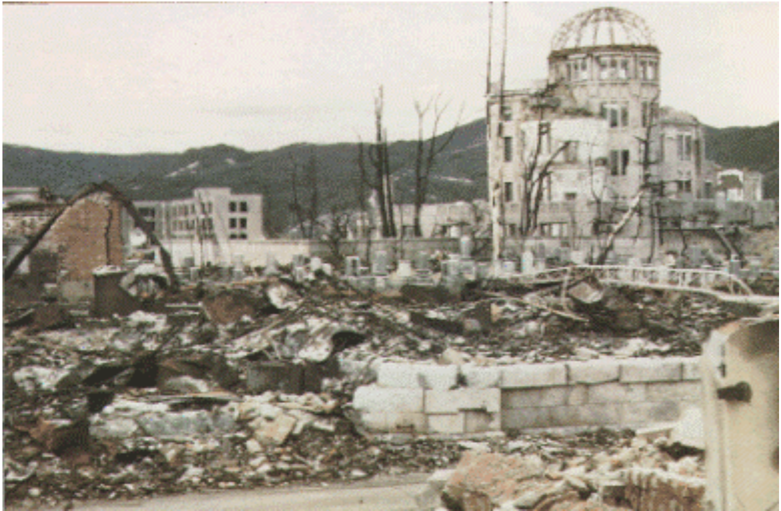
Hiroshima City after the Atomic Bombing